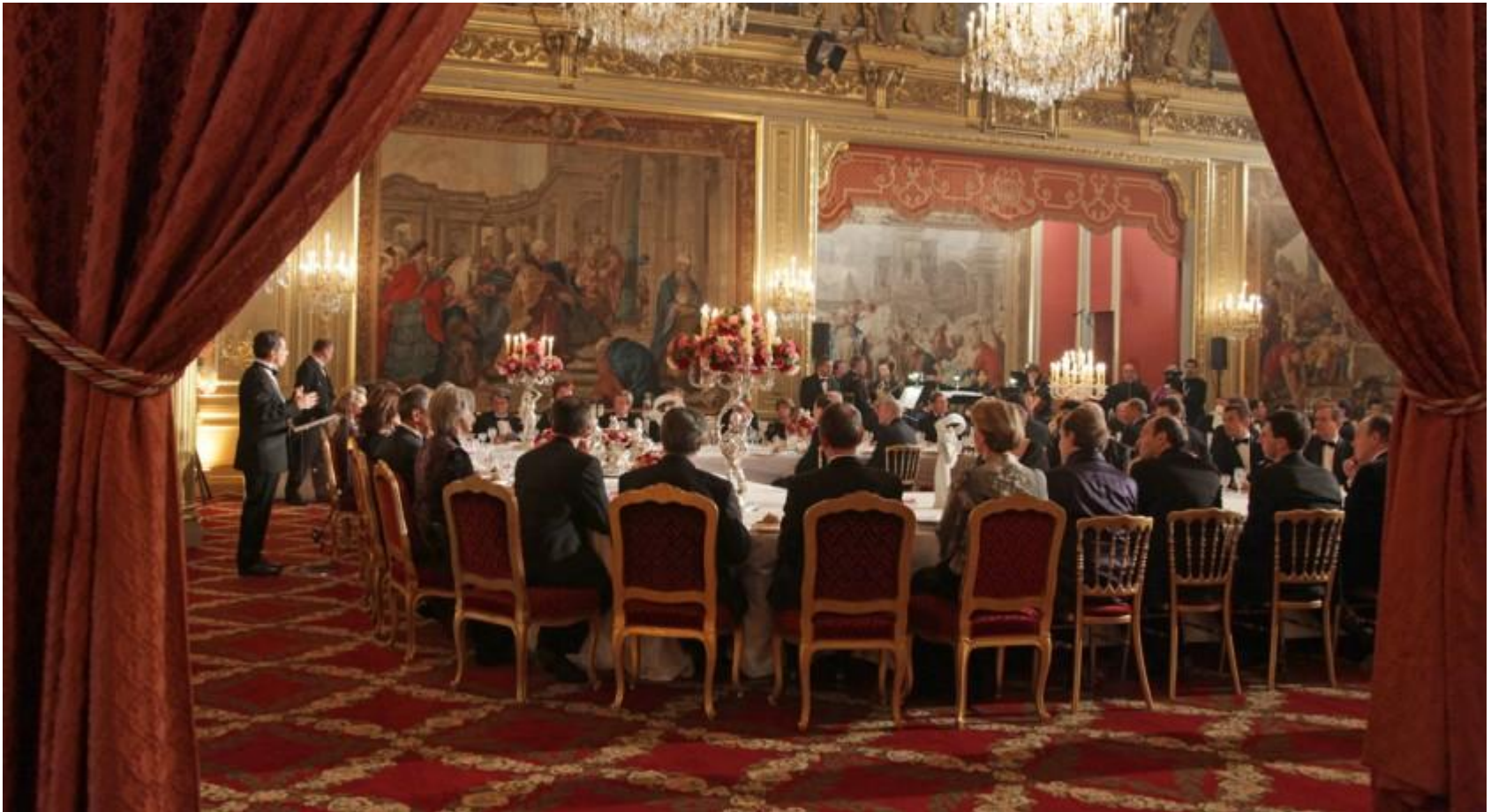
au Palais de l'Elysée

.....a state party at au Palais de L'Elysée